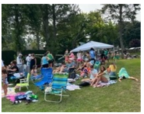
It was a tough loss against the Isle, but we face them again next Friday.